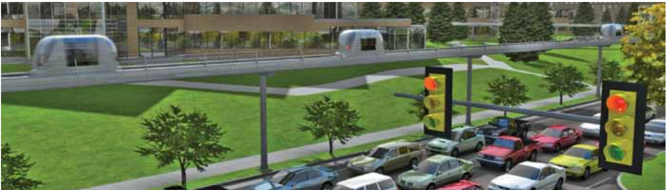
This is an example of a Personal Rapid Transit (PRT) developed by Advanced Transportation Systems, Ltd. Plans are to have these PRTs in operation this year at Heathrow Airport in London.

As you can see, all of these possibilities may drastically change the way we plan the infrastructure of our region.